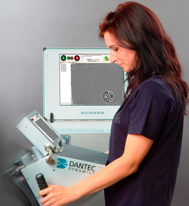
NDT inspection on a honeycomb aerospace part.