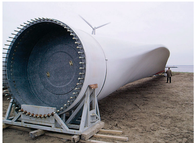
Rotor blade NDT inspections with Shearography

Shearography has been incorporated in ASNT standards since 2006. NAS 410 Certified since 2008. (SNT-TC1-A, and CP-105). ASTM standard (ASTM E2581) defines how to inspect composites with shearography. Laser shearography has been approved by leading suppliers in the aerospace, automotive, wind turbine and other industries.