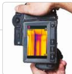
Auto orientation keeps on-screen data upright