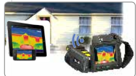
Wi-Fi connectivity with FLIR Tools Mobile app