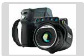
Built-in 5MP digital camera, LED lamps, laser pointer, diopter, rotating lens, image capture button and auto/manual focus.