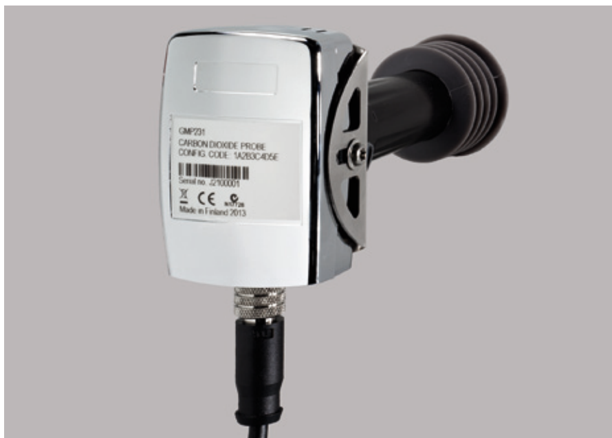
The Vaisala CARBOCAP® Carbon Dioxide Probe GMP231 withstands high temperature sterilization.

The Vaisala CARBOCAP® Carbon Dioxide Probe GMP231 is designed to provide incubator manufacturers with accurate and reliable carbon dioxide measurements and sterilization durability at high temperatures. The probe is based on Vaisala's patented CARBOCAP® technology and a new type of infrared (IR) light source. These technologies allow for sterilization temperatures of up to 180 °C, enabling easier and more complete sterilization without the risk of cross contamination.