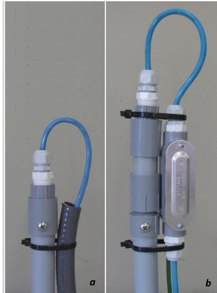
Figure 3.2 – Finishing off SAA installation under a protective well head. (a) Attaching flexible conduit to PVC conduit using zip ties. (b) Attaching SAASPD at top of borehole.

Since the PVC conduit containing the SAA has been sealed, it is not necessary for the flexible conduit to cover the entire cable. If the top of the SAA is protected using a well head covering or some other buried structure, it is possible to use zip ties provided in the kit to hold the conduit in place under the protective casing (Figure 3.2a). It is also possible to do cable splices or attach items such as the SAASPD surge protection device at this point (Figure 3.2b).