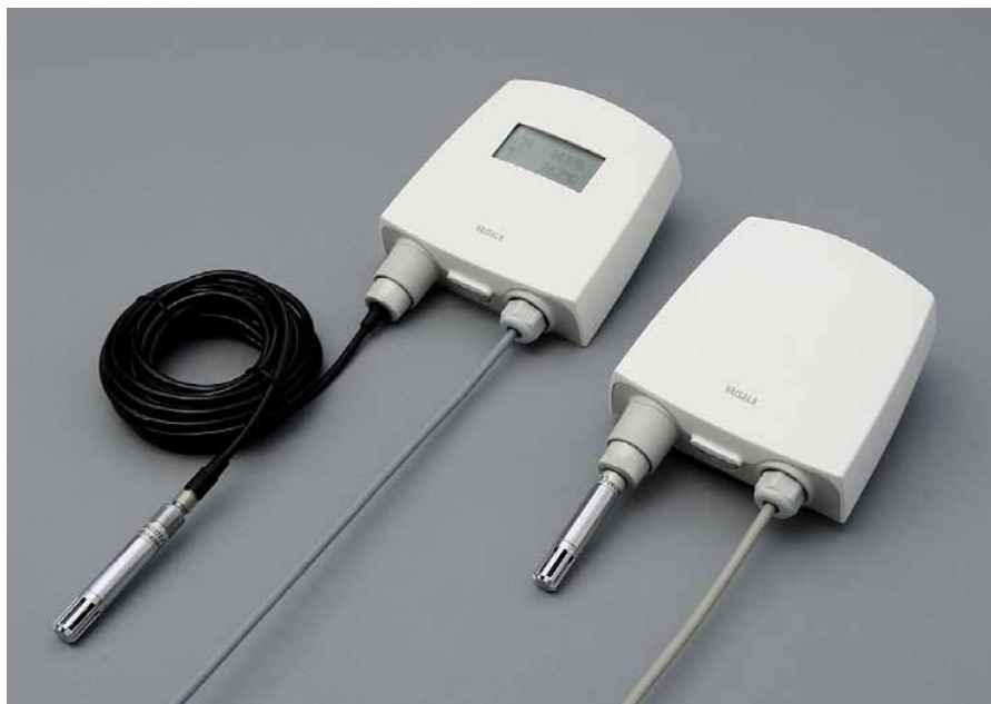
The HMT120/130 with and without a display.

The Vaisala HUMICAP® Humidity and Temperature Transmitters HMT120 and HMT130 are designed for humidity and temperature monitoring in cleanrooms and are also suitable for demanding HVAC applications.