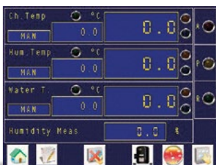
KeyKratos - Main control parameters