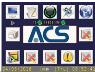
KeyKratos - Main window