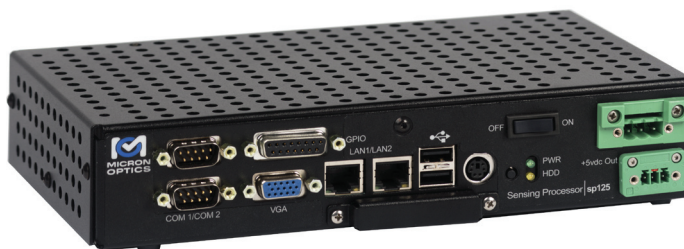
sp125 Sensing Processor Module

The data processing environment enabled by the sp125 helps engineers to bridge the gap between making measurements in the optical domain and reporting those results in the appropriate engineering units of strain, temperature, pressure, acceleration, etc.