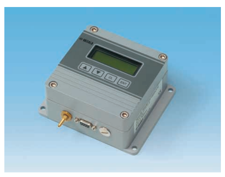
PTB220 Barometers offer excellent performance in a variety of applications.

The local display has two rows and it can simultaneously show the barometric pressure, three-hour pressure trend and WMO pressure tendency code.