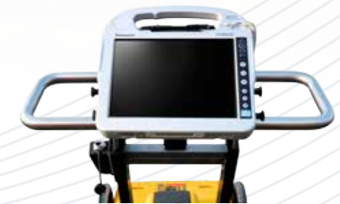
Large handle for enhanced maneuverability

No exposed cables, providing peace of mind assurance of no ruptures in the field