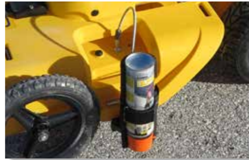
Spray marker kit

IDS's proprietary solution tracks the position of the radar and marks targets automatically. All of the acquired data can be exported to CAD and a report can be produced directly on site.