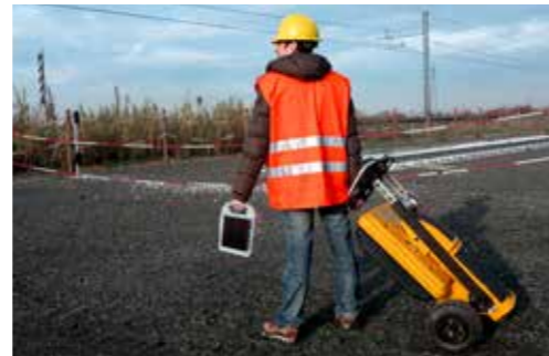
Easy to transport, foldable trolley