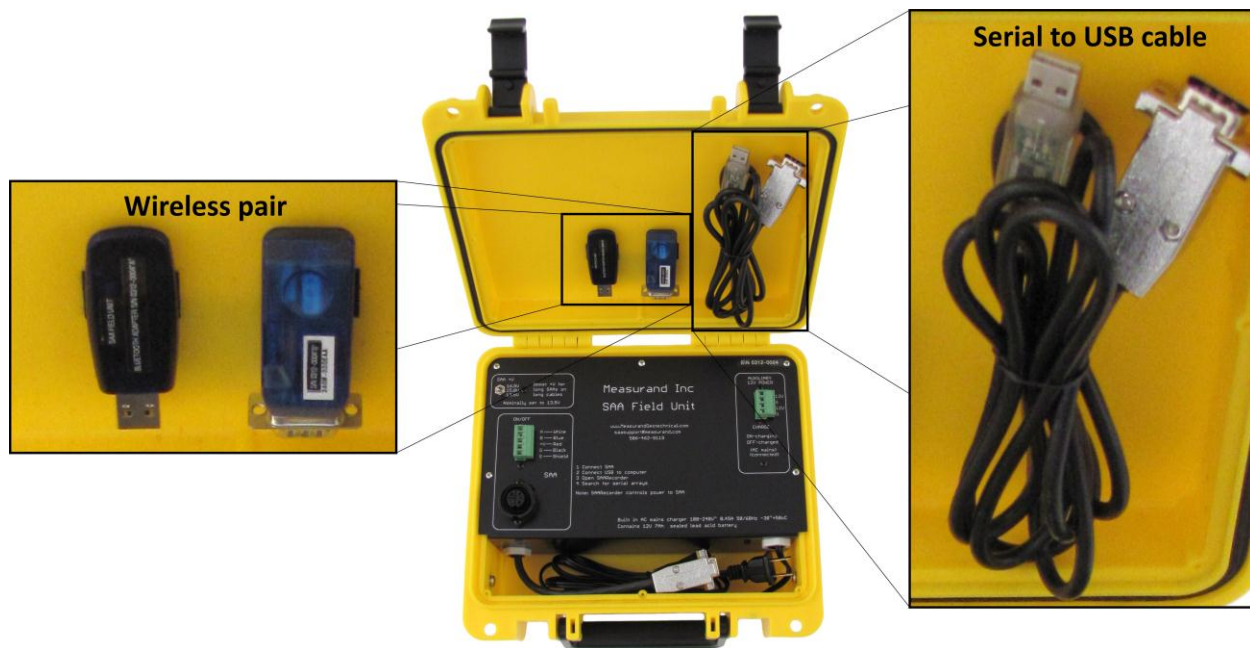
Figure 3.1: Options used for connecting the field unit to a computer running SAAREcorder.

There are two different methods which can be used to connect a computer running SAAREcorder to the SAA Field Power Unit. Communication between the SAA Field Power Unit can be done either via a wireless pair included with the SAA Field Power Unit, or via direct connection via a USB port on the computer (Figure 3.1). More details on these two communications methods are given below. Once the computer is connected to the SAA Field Power Unit, SAAREcorder will automatically power the SAA upon start-up. Note that the LED located above the 5-pin terminal block connector will light when SAAREcorder is attempting to connect to or is connected to the SAA. For more information on how to use SAAREcorder, please refer to the SAAREcorder Manual which can be found in SAASuite.