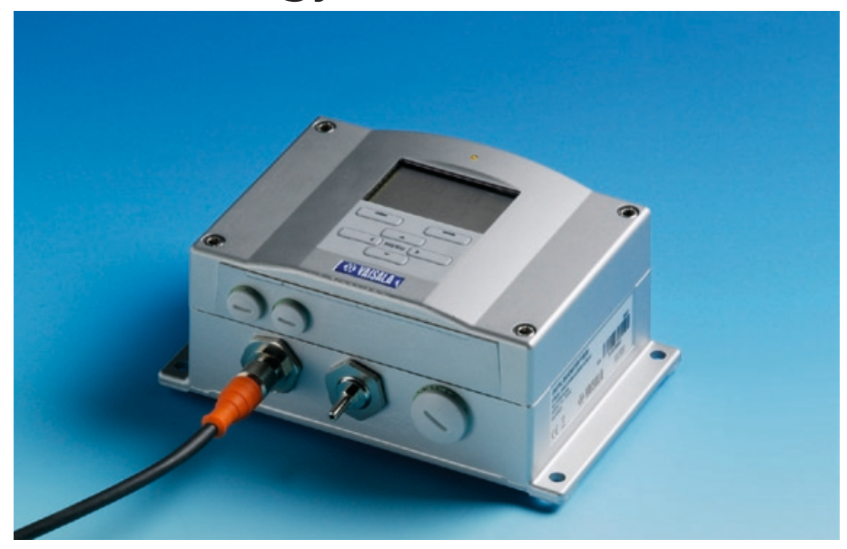
Vaisala BAROCAP® Digital Barometer PTB330 with a new trend display.