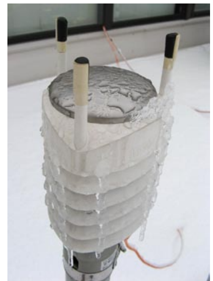
Heating at work in a WXT520.

As the power consumption of the WXT520 is very low, it can use solar panels as an energy source. Not only does this save energy, but also allows you to use the WXT520 in remote areas where electricity is not available.