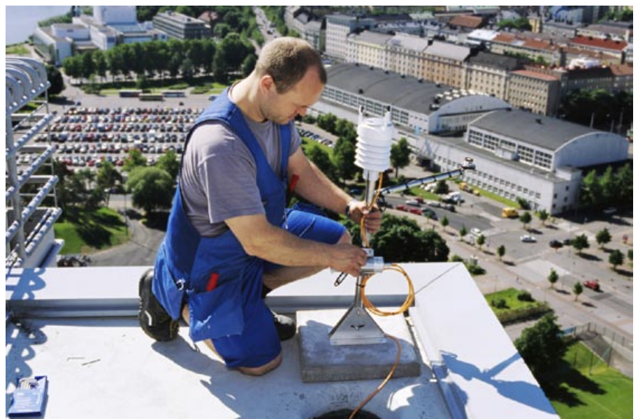
A WXT520 being installed at the top of the 72-meter tower at the Olympic Stadium in Helsinki, Finland.