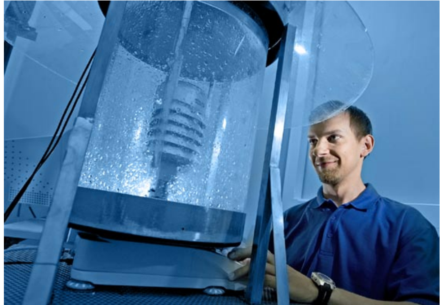
A WXT520 in the rain chamber in Vaisala.

The WXT520 housing with the mounting kit is water resistant and classified as IP66.