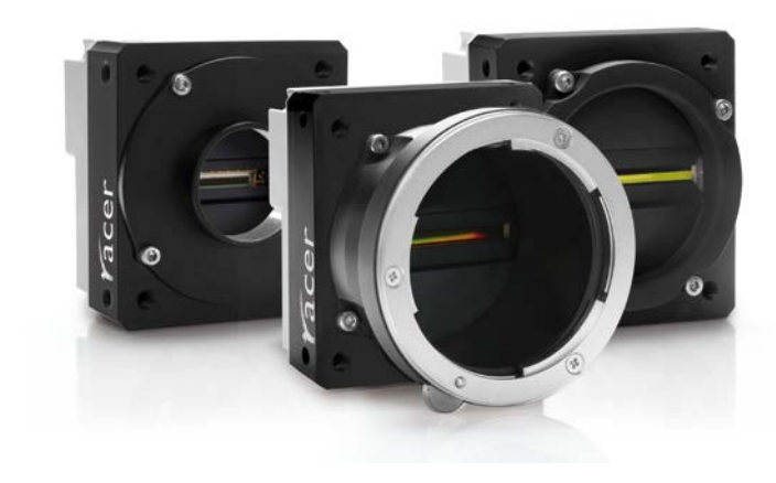
C mount, F mount and M42 lenses are always available; no custom lenses required.