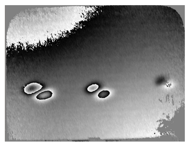
Shearography results of "dry spots" on a rotor blade

The Q-800 Laser Shearography System is a compact and fully portable NDT measuring solution that can detect defects, delaminations, disbonds, kissing bonds, wrinkling, impact damage and much more.