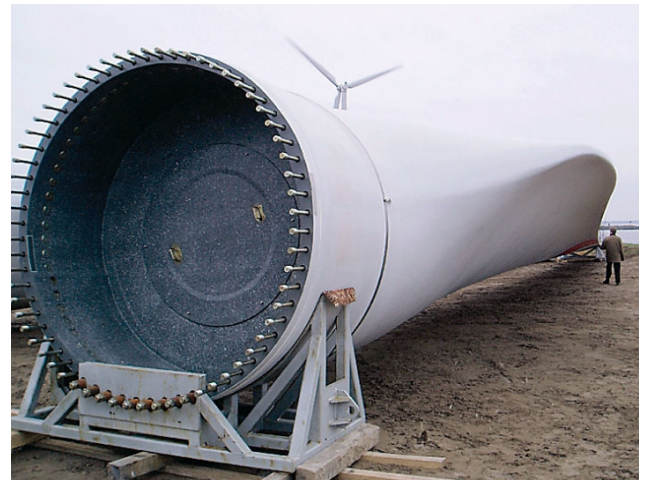
Rotorblade NDT inspections with Shearography

Shearography is an ideal method to inspect rotor blades due to its unique capability to detect wrinkling and disbonds on non-monolithic structures. In combination with the large area testing capabilities shearography is one of the most important NDT methods for production and in-field testing of rotor blades.