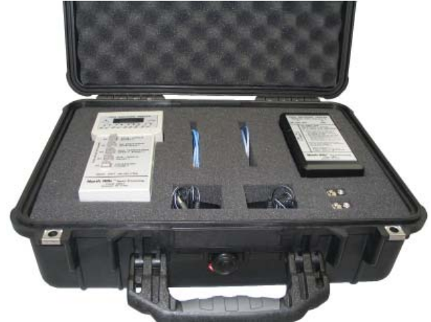
North Hills 1553 Network Tester, Model DBT 100A in storage case.

The display consists of LED go/no-go indicators and a 0.4 inch, 3 1/2 digit LCD readout for the ohm-meter mode (0 to 199.9 Ohms).