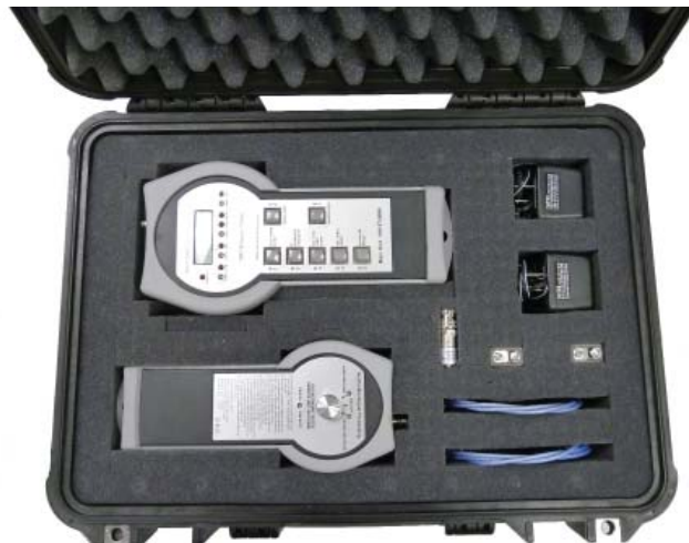
North Hills Model DBT300 1553 Network Test Set

A battery charger is included. Longer battery life is made possible by the press-to-test feature of the tester so the main unit only draws current when a button is pushed. To conserve battery life when in Phase/Crossover mode, the remote unit switches to an idle, or "keep alive" state, when not being interrogated.