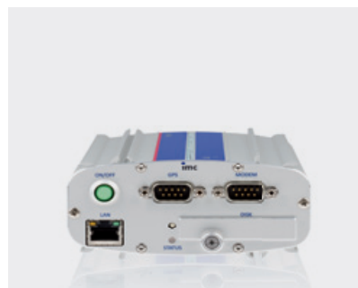
imc BUSDAQ-2, intelligent, networkable measuring system