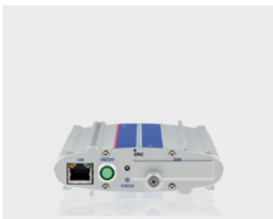
imc BUSLOG, CAN bus data logger