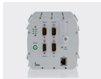
imc BUSDAQ-X, multi-bus/multi-protocol data acquisition system