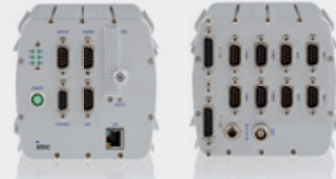
imc BUSDAQ-X Multibus data acquisition system size (W x H x D): 185 mm x 110 mm x 110 mm weight: 2 kg with 8 nodes