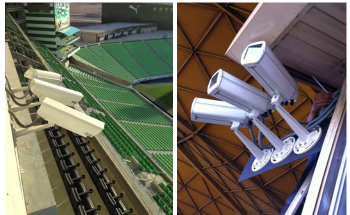
Examples of Match Analysis K2 Panoramic Video System with Basler ace GigE Cameras

The result replaces makeshift wide-angle solutions and unnatural two-dimensional overhead animations with an ultra-high resolution video that covers the entire field and features a pan and zoom function to provide the user with complete control over the video they view. In addition, Match Analysis uses the resulting stitched video to accurately track all 22 players and the referees, using advanced object tracking software. Match Analysis then delivers a wide variety of tools and data for in-depth video and statistical analysis which provide the ability to draw dynamic animated graphics within the video itself - instantly and interactively.