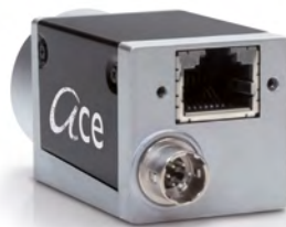
Basler ace GigE Cameras