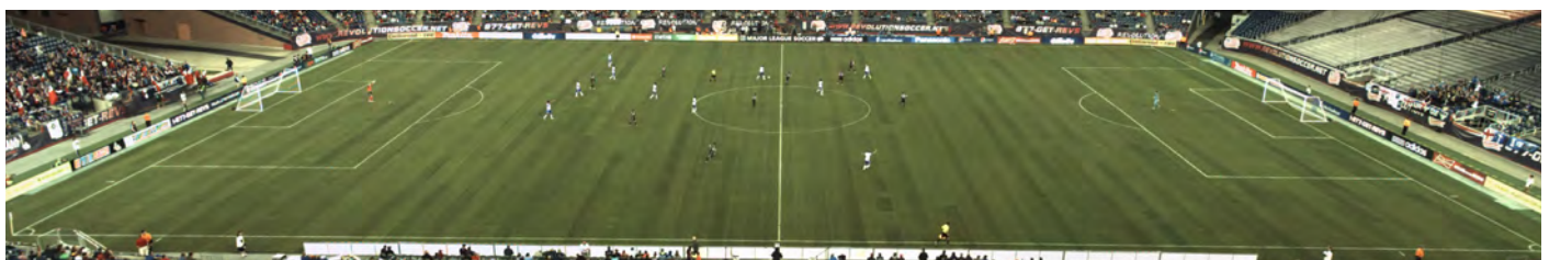
Match Analysis K2 Panoramic Video Full Pitch View Achieved with Basler ace GigE Cameras