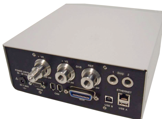
PACE1000 from the rear