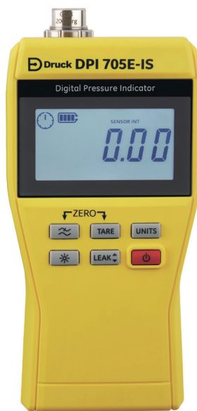
Hazardous Area Pressure Indicator

The Druck DPI 705E Series of handheld pressure and optional temperature indicators combine tough and rugged design with accurate and reliable measurements.